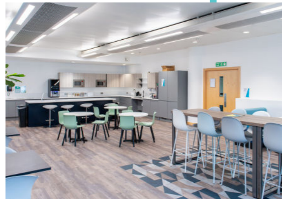
Project Date: 2023 Project Size: 125,722 Sq Ft Categories: Office Refurbishment, Workplace Design